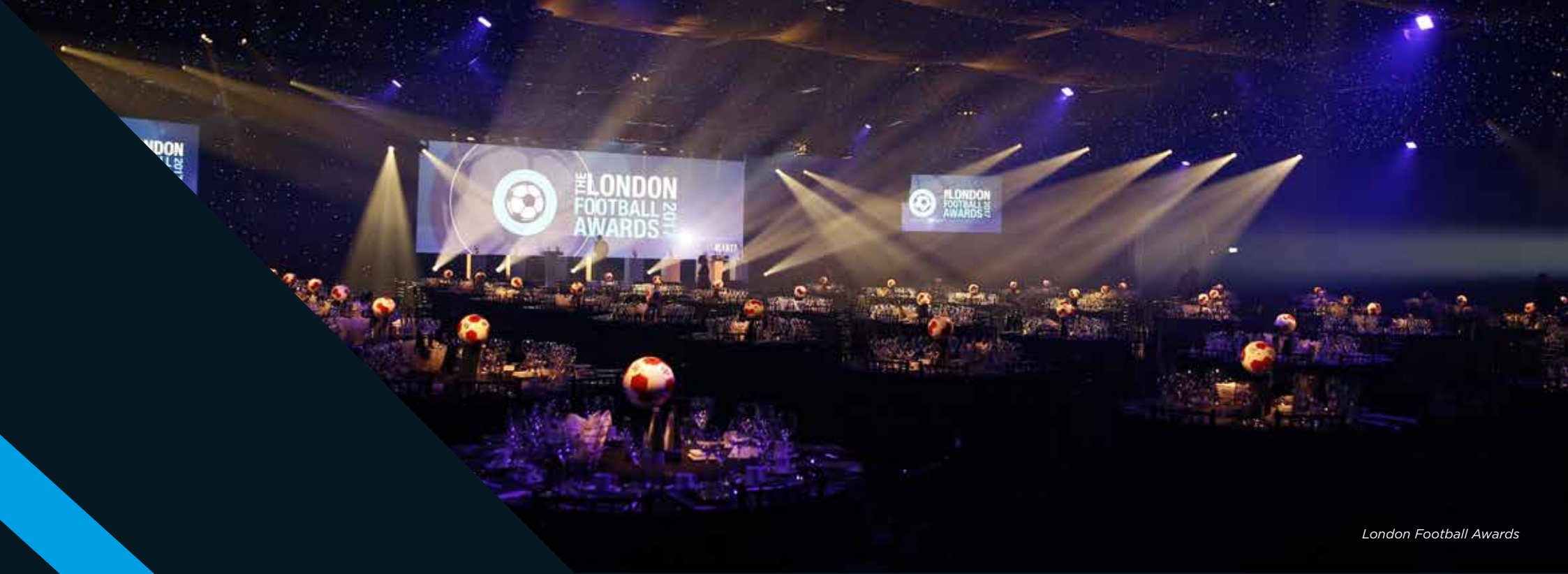
London Football Awards