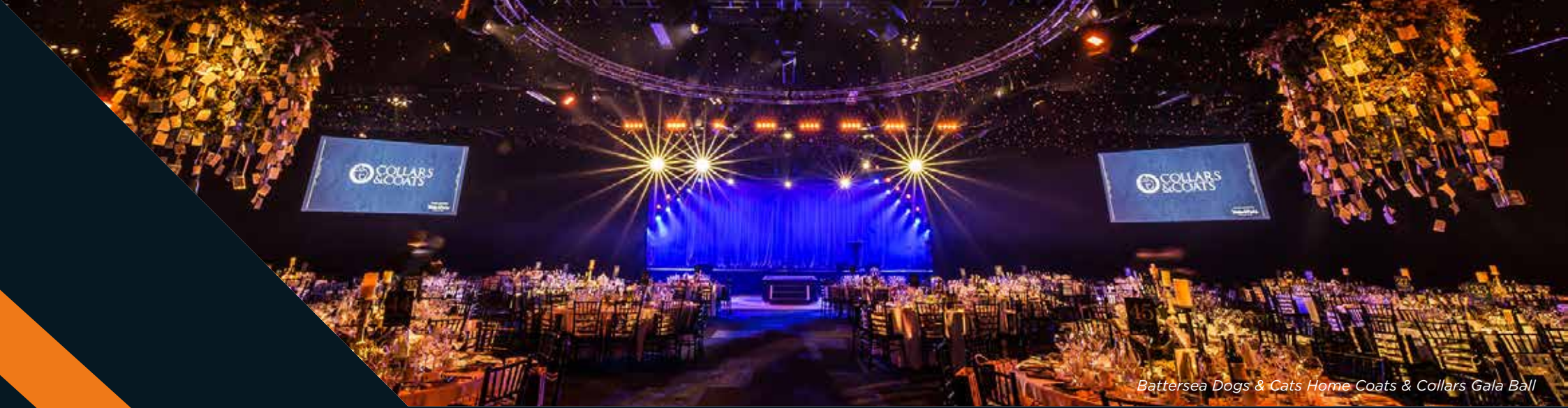
Battersea Dogs & Cats Home Coats & Collars Gala Ball